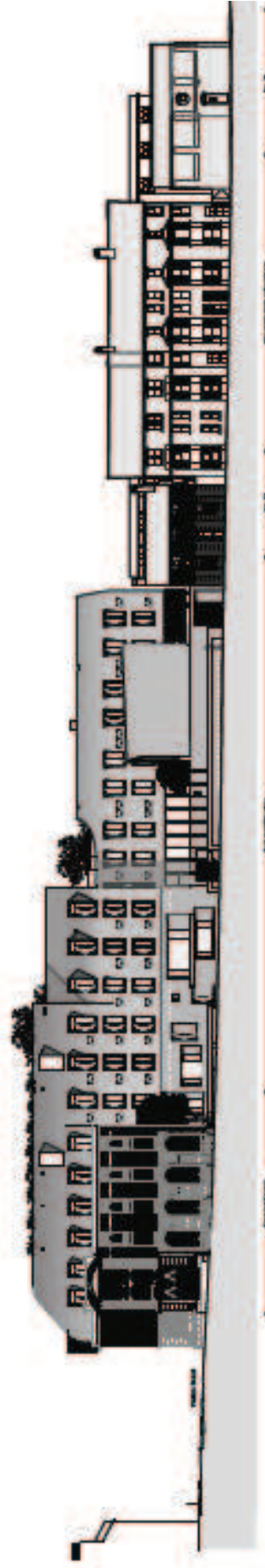
2 HOCHSCHULEPLATZ BILDBAUEN