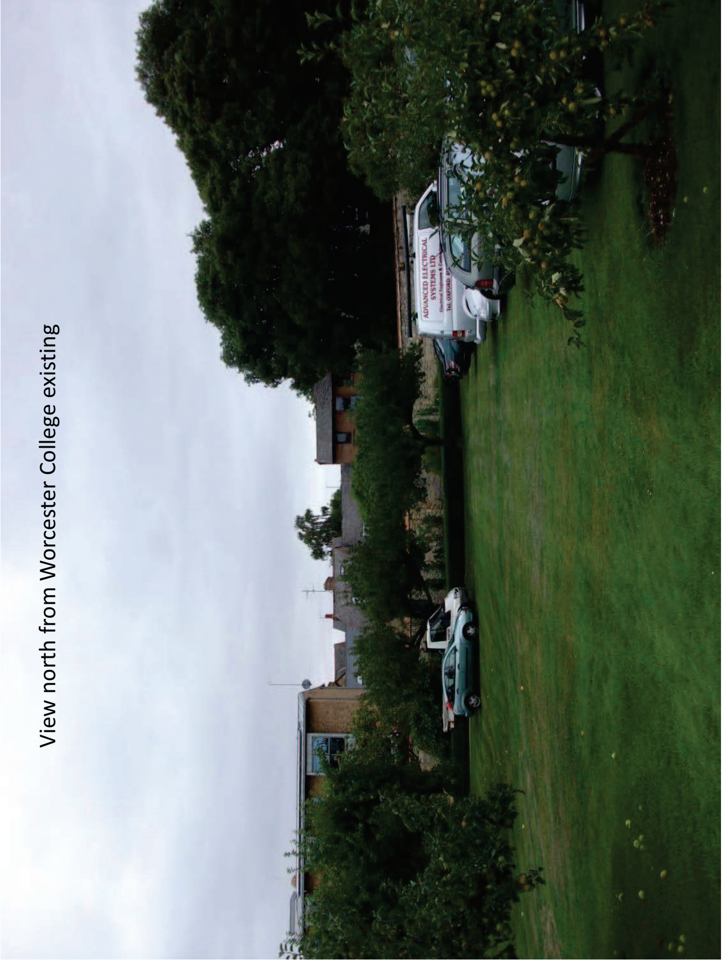
View north from Worcester College existing